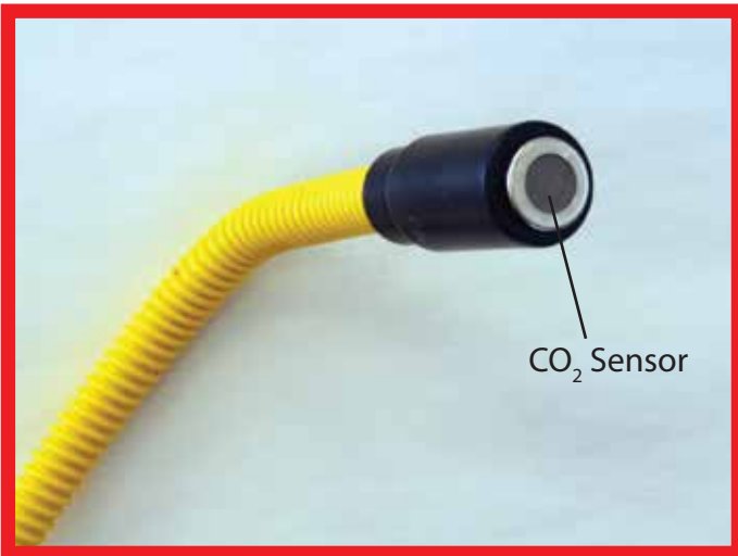
CO 2 Sensor